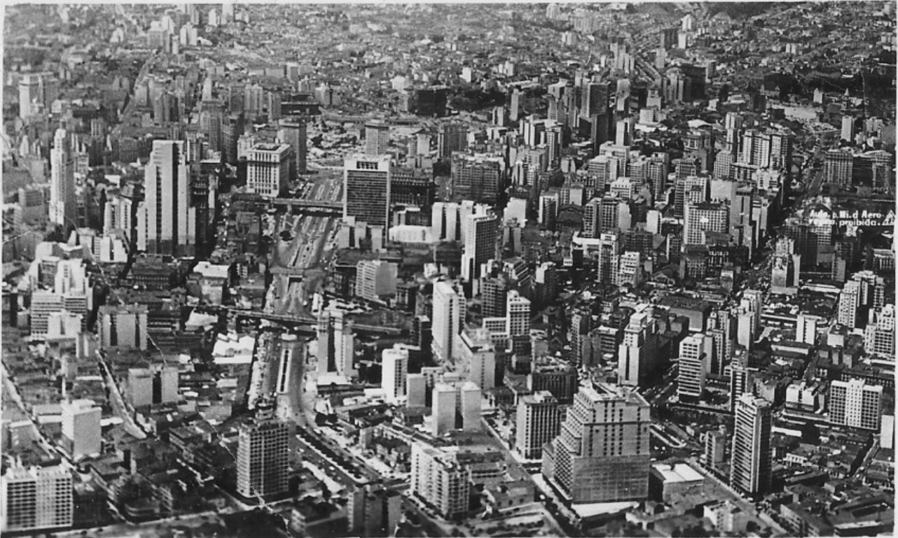
Panorama do Centro