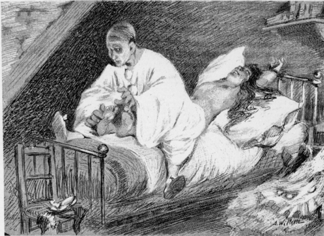
PIERROT ASSASSIN DE SA FEMME

Voir, dans la Revue Illustrée de cette semaine, la charmante musique de VIDAL et les dessins de WILLETTE accompagnant cette tragique et belle pantomime, qui fut mimée au Théâtre-Libre par l'auteur, PAUL MARGUERITTE